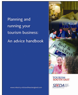
Business Advice Handbook B&B / Self-Catering / Combined